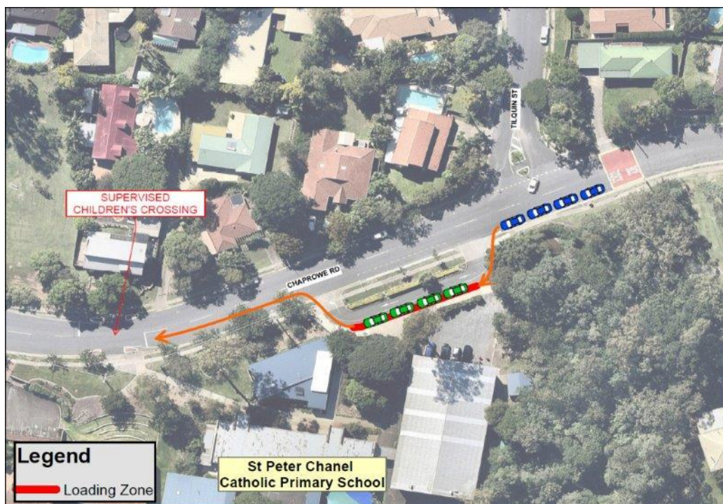
Figure 1: Map of Stop, Drop and Go Zone