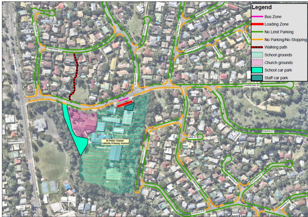
Figure 2: Map of parking areas

The Staff Carpark at the front of the school, behind the Stop, Drop and Go Zone, is reserved for school and OSHC staff.